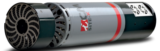
ICM SITEX C1802

Pipeline dimensions are dependent on X-Ray Tube