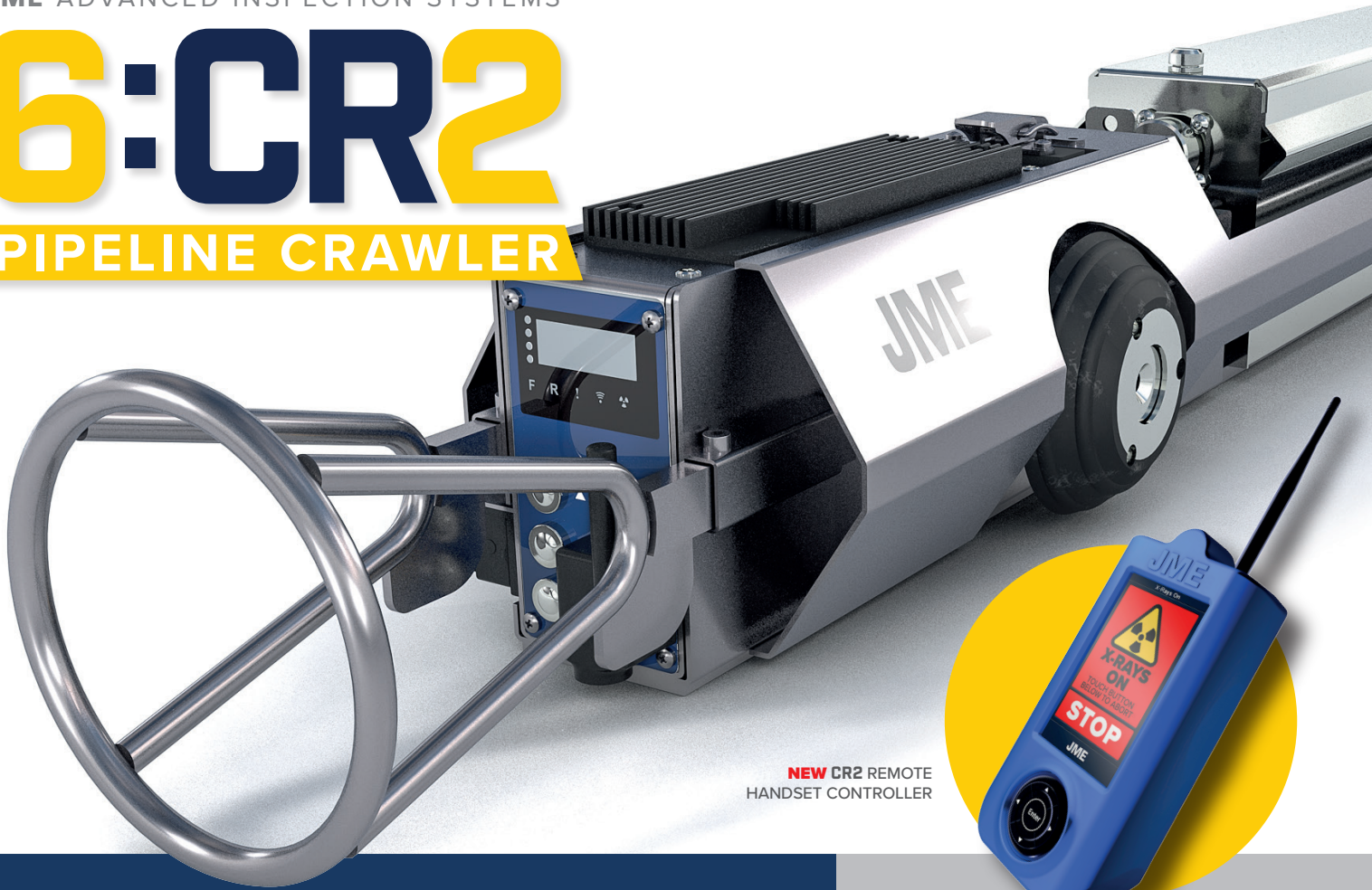
NEW CR2 REMOTE HANDSET CONTROLLER