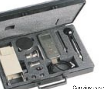
Carrying case for MIC 10 and accessories

HV, HB, HRC, HRB N/mm<sup>2</sup> (only with the 10 kgf handheld probe) according to DIN 50150, ASTM E 140